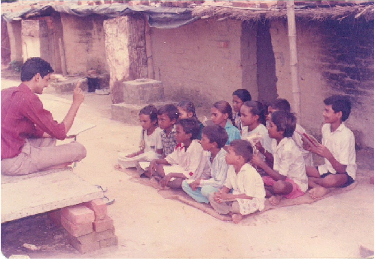
From A Single Room 25 Years Back