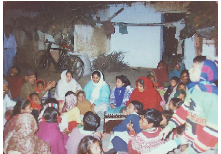
People kept endorsing the initiative